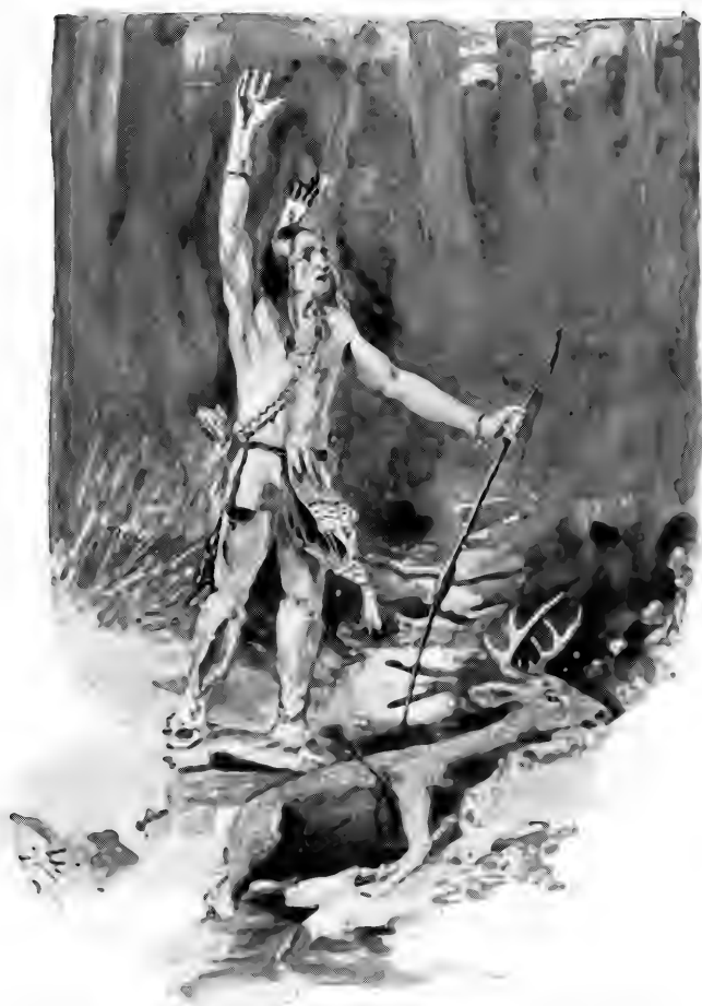
"AND THE BROWN HUNTER'S SHOTS WERE LOUD AMID THE FOREST."—Page 18.